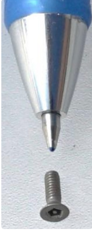
— Drive Sizes for Button Head & Flat Head Machine Screws —