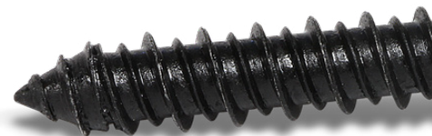
▲ 1/4 x 2 STYKFIT®7 Concrete SMS Security Screw, Alloy Coated with BryKote™

$100.00 minimum for STYKFIT®7 Security Drive. 2,500-piece minimum for Key-Rex® Security Drive.