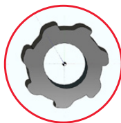
STYKFIT®7 $100 Min.