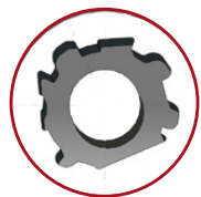
Key-Rex® 2,500-Piece Min.