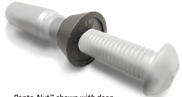
Penta-Nut™ shown with deep socket and Key-Rex™ bolt.