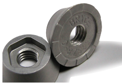
Pentagon shape deflects all known tools.