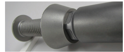
Thin profile socket fits inside the Penta-Nut which allows for incredible strength and torque loads.