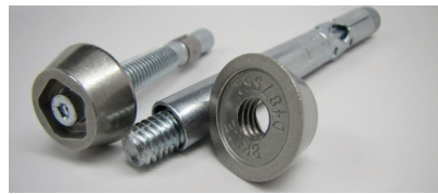
A perfect solution for securing large items with concrete anchors.